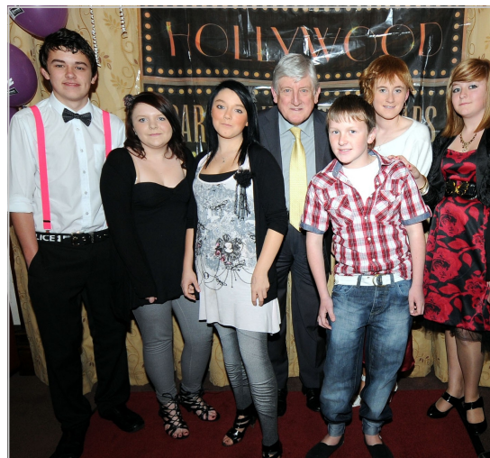
Attendees at a B-Safe film night in North East Derbyshire

B-Safe has been running since July 2009 and initially focused on areas within Bolsover, Chesterfield, North East Derbyshire, High Peak and North Dales. B-Safe team workers have identified drinking hotspots and worked to raise young people's awareness of the impact of alcohol consumption. A wide range of positive alcohol free activities have been available on Friday and Saturday nights and the number of young people attending these activities has more than doubled in the project period.