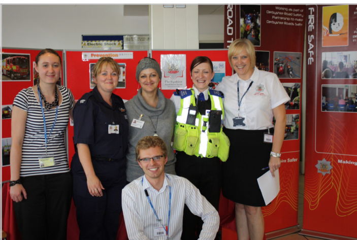
Pictured are partners at the Shirebrook engagement event in November 2010

An initial event in Shirebrook in November 2010 saw partners successfully engage with over 600 migrant workers within the Sports Direct Distribution Centre. Questionnaires were distributed to