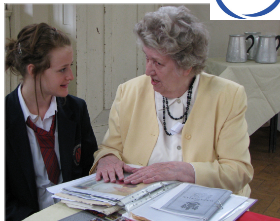
Participants at a Heritage Day at Ilkeston Specialist Arts College, funded by the 2010 Bringing People Together Fund.