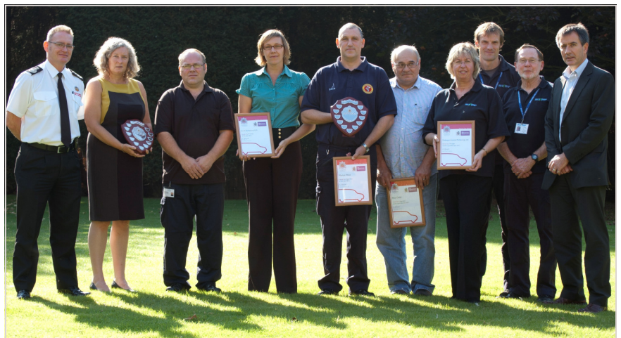
Pictured are the presenters, winners and runners up of Handy Van Awards 2011

More information about the scheme is available online on www.derbyshire.gov.uk/handyvan